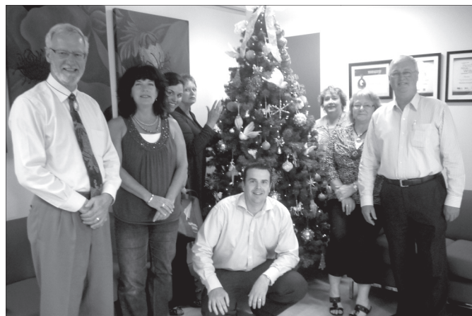
Christmas spirit in Waitakere: wrapping gifts for the 50 children who have been affected by family violence