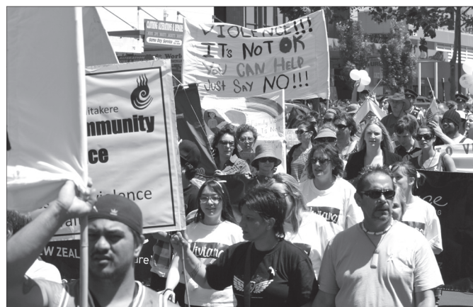
Marching at White Ribbon Day, where men are encouraged to stand up against violence towards women and children